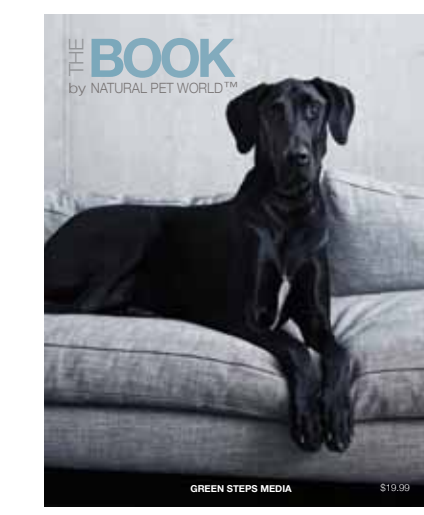
The BOOK by Natural Pet World Magazine

Natural Pet World has curated a comprehensive guide to help modern pet owners make the healthiest, most sustainable and socially responsible choices for the four legged friends in their life, without sacrificing style. $19.99 shop.naturalchildworld.com