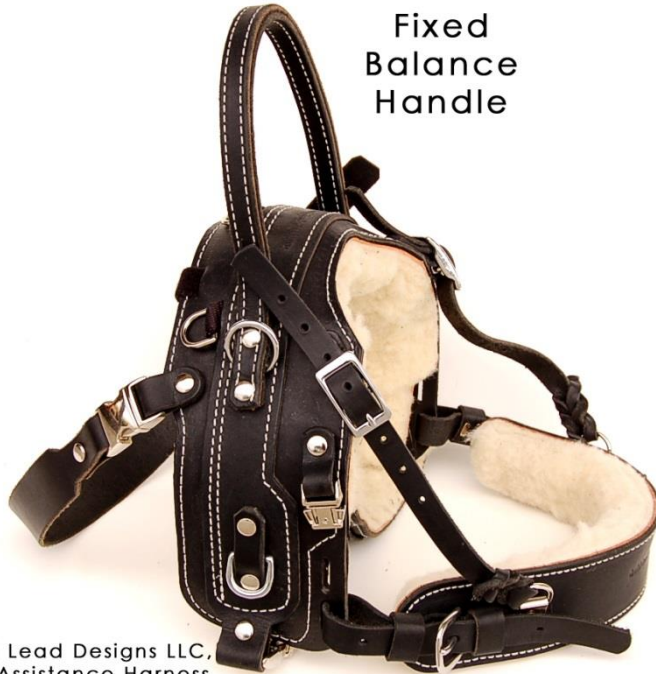
Fixed Balance Handle

Sized to fit any breed dog! Any handle length!